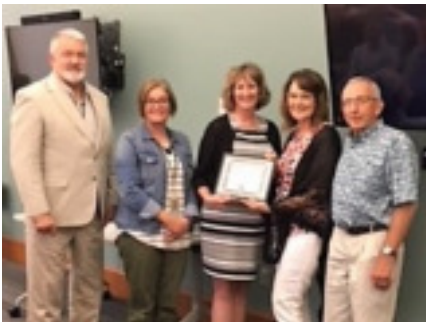
Pictured Left: Central Iowa Community Services receiving the Outstanding Partner Award