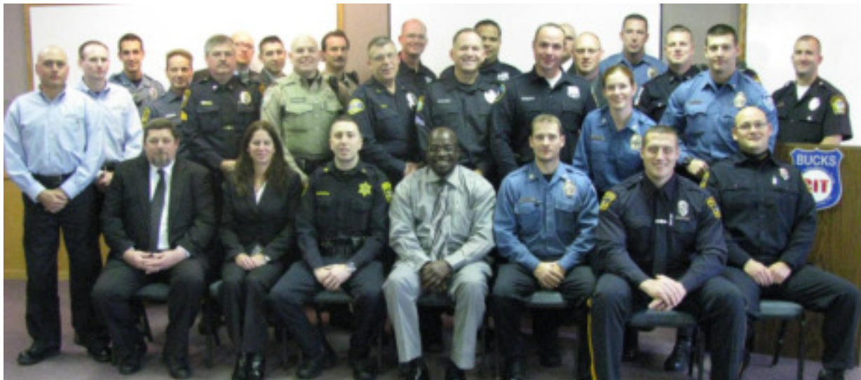
CONGRATULATIONS to the ninth graduating class of Bucks County's Crisis Intervention Team (CIT) on October 25, 2013. These graduates bring the total to 239 certified CIT graduates that have advance training in mental health and related issues.

On October 25, 2013, the Bucks County CIT Task Force was proud to welcome 29 new graduates into the CIT family. Bucks County is a Philadelphia suburb that encompasses 607 square miles, 626,000 residents, policed by 42 full and part-time police departments. This graduating class was Bucks County's ninth CIT training, bringing the grand total to 239 certified CIT graduates. 50% of police departments in Bucks County now have trained CIT officers since the first training began in September, 2009.