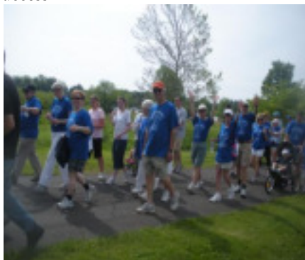
Bucks for Brains Walkers

NAMI of PA, Bucks County Chapter's team "Bucks for Brains" participated as did several other teams from Bucks County, including Bring Change 2Mind in Pennsylvania, Can't Tough This, Dave's Crew, Project Transition Warminster, and Team Wellspring.