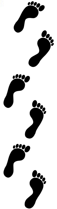
NAMI Bucks County Team, "Bucks for Brains"

The Third Annual Greater Philadelphia NAMI Walks for the Mind of America, a fundraising and awareness-raising event, was held Sunday, May 2, 2010, at Montgomery County Community College in Blue Bell, PA. The Walk was a huge success.